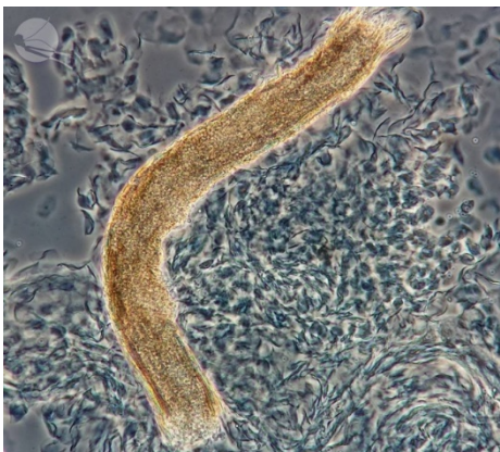
Endothrix hair invasion (trichophytic)

In all cases: mycological specimen recommended