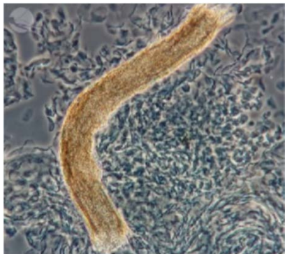
Endothrix invasion of the hair (trichophytic infection)

In all cases: mycological specimen collection recommended